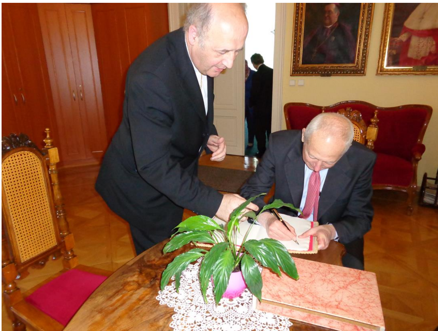
Prince of Liechtenstein, Hans-Adam II, signing the Archbishopric of Olomouc memorial book on May 20, 2014