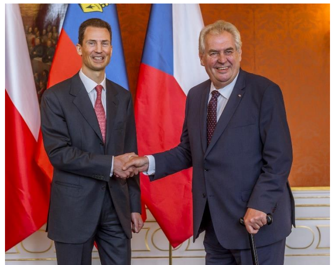
H. S. H. HEREDITARY PRINCE ALOIS OF LIECHTENSTEIN AND CZECH PRESIDENT MILOŠ ZEMAN AT PRAGUE CASTLE

Since the restoration of diplomatic relations between the Czech Republic and Liechtenstein in September 2009, this is the second meeting at the level of heads of states. The first was the visit of governing Prince Hans-Adam II to Prague Castle on 1 June 2010 when he met with then-President of the Czech Republic, Václav Klaus, on the occasion of the opening of the 'Classicism and Biedermeier in Liechtenstein's Princely Collections' exhibition, which took place in the Waldstein Palace Riding School in Prague.