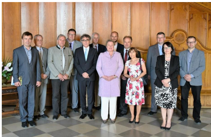
MAGAZIN ZEMĚ SVĚTA – LIECHTENSTEIN