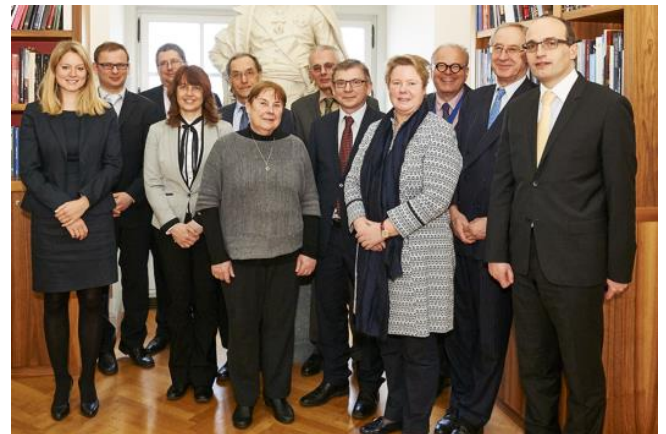
MEMBERS OF THE CZECH-LIECHTENSTEIN HISTORY COMMISSION AND AMBASSADORS OF THE CZECH REPUBLIC AND LIECHTENSTEIN

its first phase have brought key findings on more than 700 years of joint history of the Czech lands, the House of Liechtenstein and modern history relating to the Principality of Liechtenstein. We trust that the Commission's further research will uncover more fascinating information and help to deal with open issues regarding our joint history.